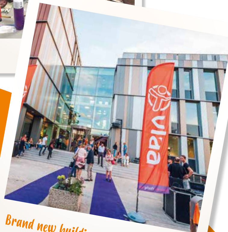
Brand new building of Viaa in Zwolle