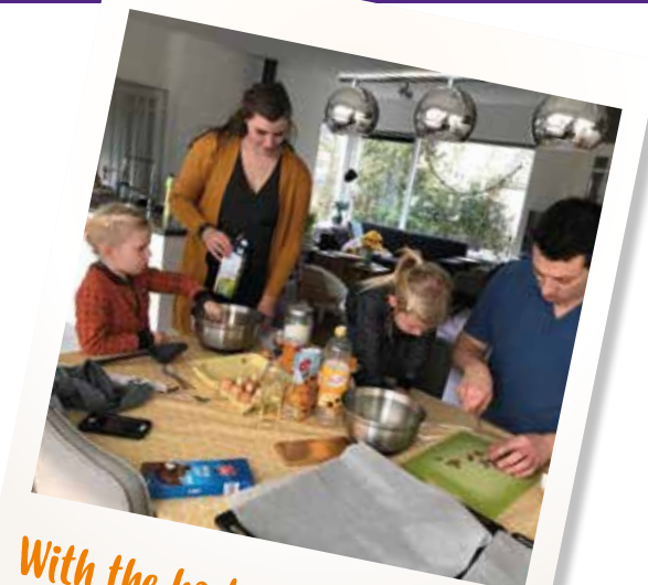
With the host family