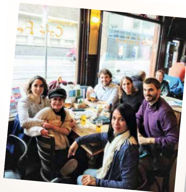
With friends in Amsterdam