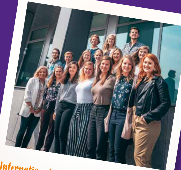
International class 2019

As a University of Applied Sciences, our programmes focus on the students' professional training. Theory and research are applied to the future professional context. The introduction to the future professional practice by means of internships already starts in the first academic year. Education at Viaa can be characterised by a wide variety of teaching methods, involving a lot of interaction between lecturer and students. We make a strong appeal to the students' independence and their responsibility. Viaa is a small-scale university. Consequently, there is a lot personal attention for our students.